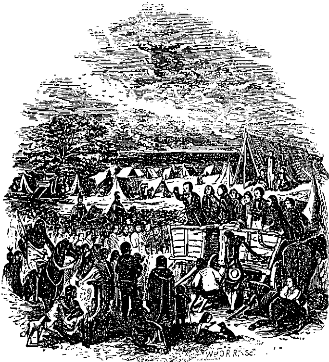
JOSEPH SMITH PREACHING IN THE WILDERNESS.